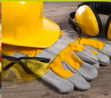
HEALTH & SAFETY AT WORK