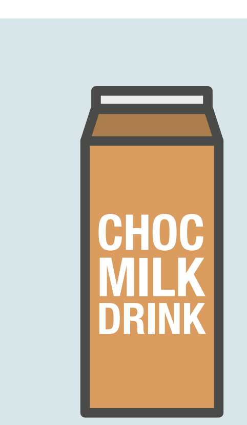
Milk Drink £1.28