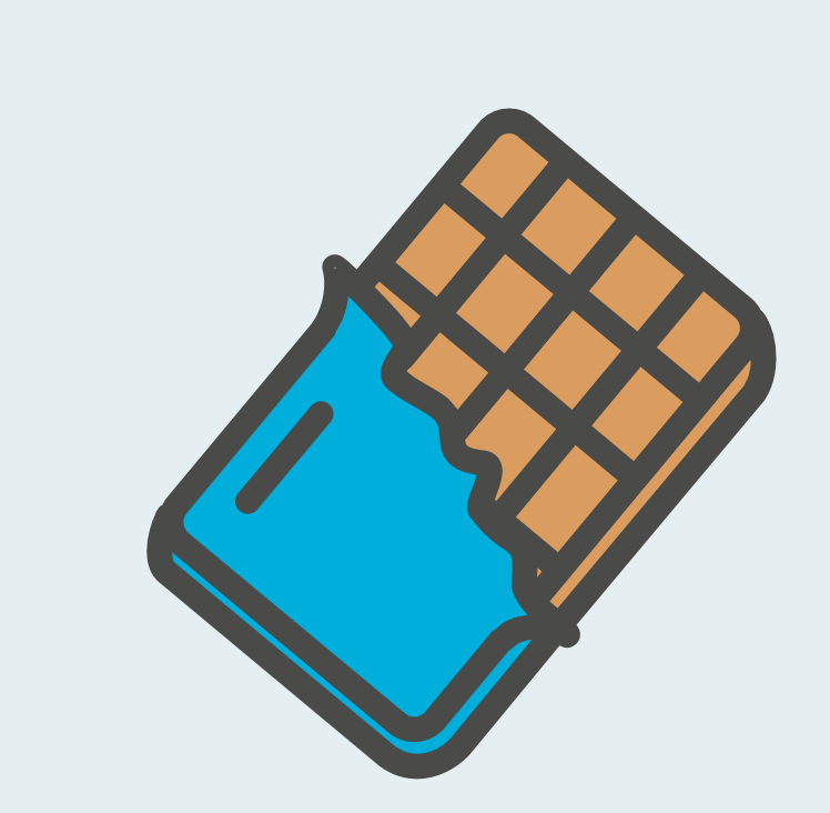
Chocolate Bar 75p